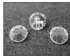
The Bevin Boy Medals